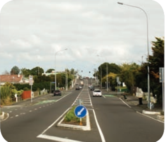
Sandringham Rd. before and after undergrounding.

Through the agreement we have with Vector more than $10.5 million is invested in this programme every year in the Trust District. And so far it's transformed over 140 kilometres of neighbourhoods right across Auckland, Manukau and Papakura – and said goodbye to thousands of unsightly power poles!